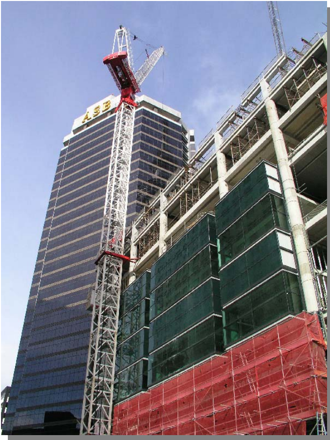
Left: October 2003

The curtainwall chosen for this project is Thermosash's unitised panelwall system with an integrated feature terracotta tile spandrel sourced from Europe. This total-clad solution was selected in preference to a typical structural spandrel and strip window system due to the speed of installation and the integrated weathering solution a unitised curtainwall system provides. The terracotta tiles also provide a cost saving against the more traditional granite stone option. Approximately 56 tonnes of "Tuscany Red" terracotta tiles measuring 200mm by 400mm are being installed on Auckland's new 24 storey Sky City Hotel on Albert Street, linked to the Sky City Casino.